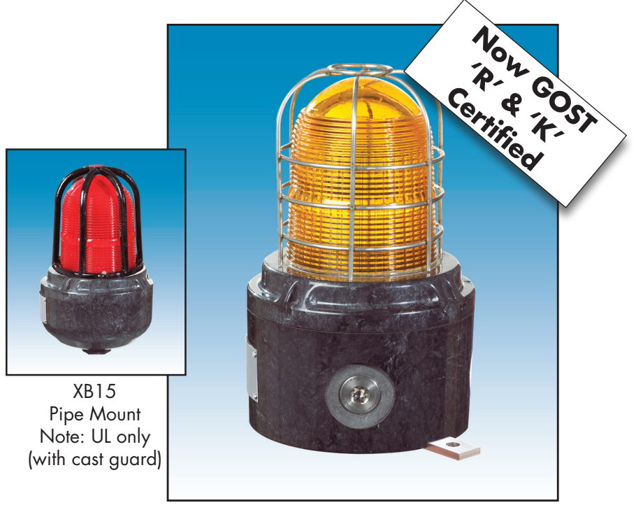
XB15 Direct Mount (with backstrap and wire guard)